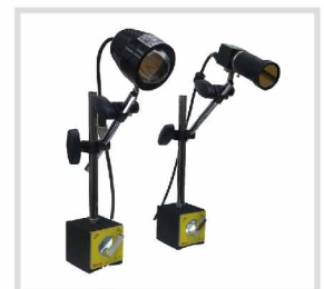
Camera and light source