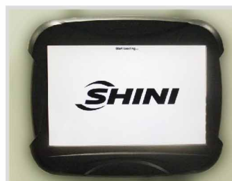
Main controller 10"