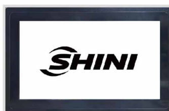
Main controller 13.3"